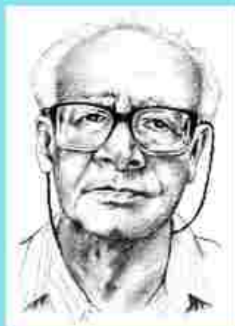
M. N. Srinivas (1916–1999)

Mysore Narasimhachar Srinivas was one of India's foremost sociologists and social anthropologists. He was known for his works on the caste system and terms such as 'sanskritisation' and 'dominant caste'. His book The Remembered Village is one of the best known village studies in Social Anthropology.