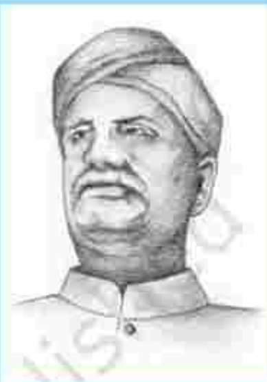
Ayyankali (1863 – 1914)

Ayyankali, born in Kerala, was a leader of the lower castes and Dalits. With his efforts, Dalits got the freedom to walk on public roads, and Dalit children were allowed to join schools.