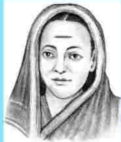
Savitri Bai Phule (1831–1897)

Savitri Bai Phule was the first headmistress of the country's first school for girls in Pune. She devoted her life to educating Shudras and Ati-Shudras. She started a night school for agriculturists and labourers. She died while serving plague patients.