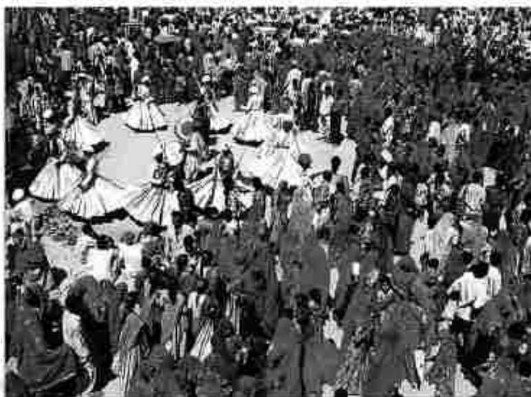
A tribal village fair

During the 1960s scholars debated whether tribes should be seen as one end of a continuum with caste-based (Hindu) peasant society, or whether they were an altogether different kind of community. Those who argued for the continuum saw tribes as not being fundamentally different from caste-peasant society, but merely less stratified (fewer levels of hierarchy) and with a more community-based rather than individual notion of resource ownership. However, opponents argued that tribes were wholly different from castes because they had no notion of purity and pollution which is central to the caste system.